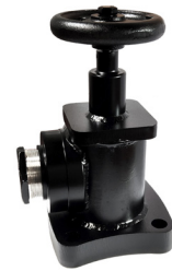
LEAKING VALVE (FACSIMILE)

For simulating leaks for the hands-on training with the Indian Springs ERK and other rail car capping devices. The valve manifold allows the instructor to simulate a leak, with water or compressed air, in either of the 2" product valves or through the pressure relief device. Unit comes with a hinged lid and locking pin assembly. Heavy duty casters allow for safe and easy handling.