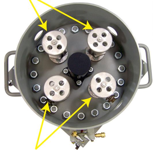
Leaking Valves (2 pcs.)