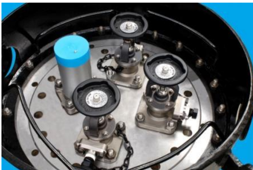
Figure 1: NGRTC Valve Arrangement

Twenty-five rail cars equipped with chlorine valves under AAR Service Trial 422 are currently in service. These cars are equipped with valve assemblies significantly different than those currently in chlorine service. The liquid and vapor valves are designed to actuate spring loaded check valves that are positioned under the fittings flange. This is very similar to the configuration used in some other services but is a significant deviation from what is typical for chlorine service. This new configuration is intended to reduce the likelihood of any product loss in an accident situation.