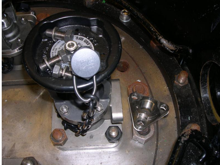
Figure 3: Midland Valve with Flange Removed

body. The pipe plug does not have to be removed; it can be placed on top of the handle.