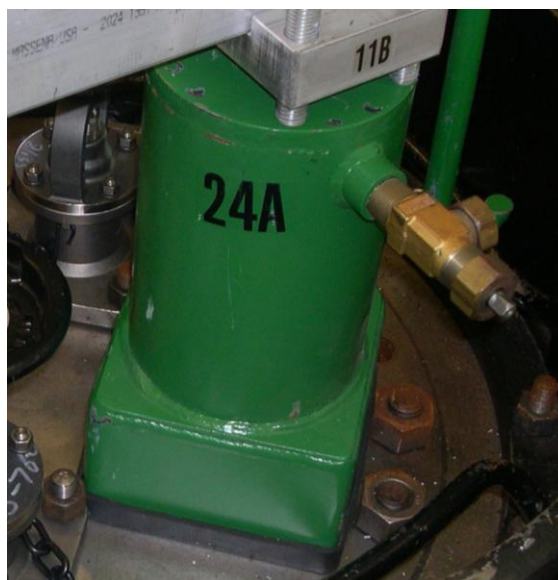
Figure 2: Emergency Kit C Part # 24A Hood Assembly

It is anticipated that the frequency of capping applications will be reduced even below that of the current design with this new configuration. However, it is important that all who might be called upon to respond to a car with this configuration are alert to the differences and the need to treat the application differently.